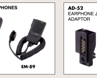
JACK ADAPTOR connector to $ 3.5 mm